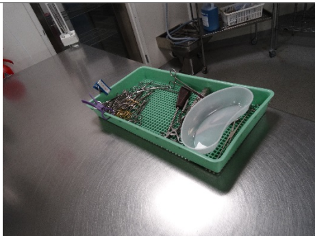
Figure 1: Trays