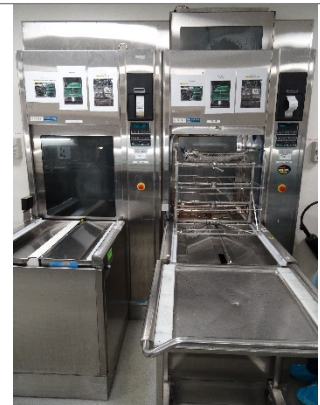
Figure 3: Washing machines