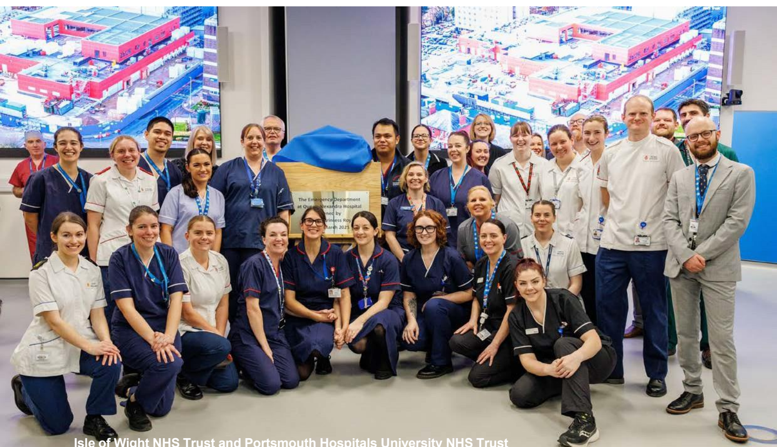
Isle of Wight NHS Trust and Portsmouth Hospitals University NHS Trust

Research and innovation thrives within the trust which plays a key role in developing multi-disciplinary research and strengthening nursing research ambitions. There are 150 research staff across clinical specialties, increased participation in clinical trials and we receive £8 million in major grants for our research activity.